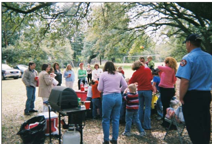
Firefighters were recently invited to participate in a birthday party at Willowbank park where a number of kids enjoyed meeting the firefighters and seeing the equipment on our trucks.

Total Rainfall for the Month: 4.36 Inches Total Rainfall for the Year: 12.52 Inches